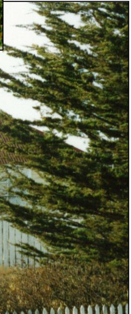
Second Deanery 1992

The second deanery was demolished in 1997 to make way for the present Deanery, built in 1997 and also a kit house.