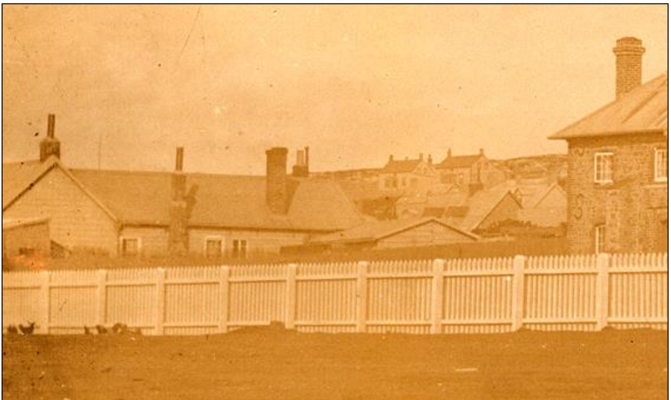
The old Deanery – Luxton Collection

In May 1855 the Deanery was described as a wooden house nearly opposite the guardhouse but on the south side of Ross Road "It consists of a cottage fronting the Ross Road 28 feet long by 16 feet wide, divided into two rooms and a lobby. To the south at right angles another wooden building is hipped on about 36 feet long and 14 wide containing a kitchen 14 feet square, bedroom 8 x 14 and hall 14 feet x 12. The front is divided into a sitting room 17 feet x 15 ft and bedroom 15 feet by 10 ft. The register stone mantelpiece, fender fire irons and cupboards belong to the Government – the other articles in the house to the present tenant the Revd Mr Faulkner, as also the kitchen grate & fixtures in the kitchen. A small wooden building on the west side of the kitchen detached from the house belongs also to the tenant.