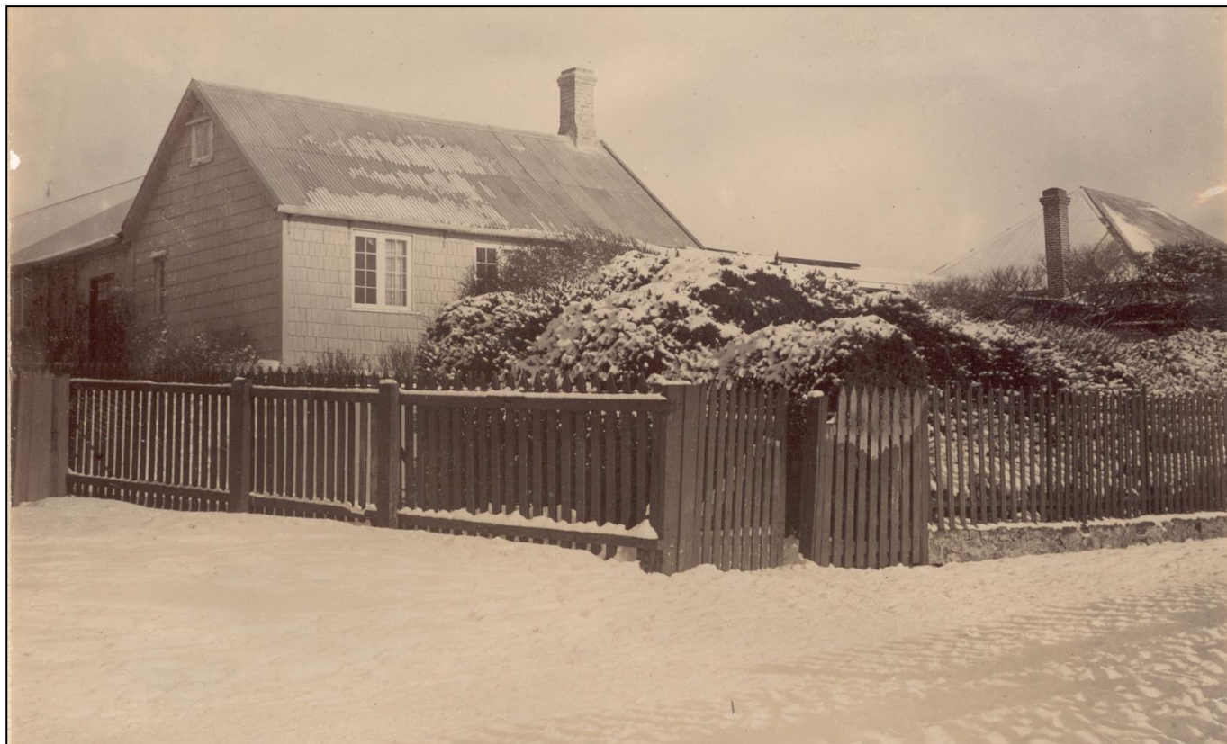
The old Deanery